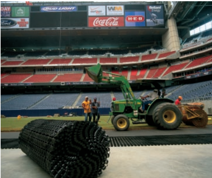
Above: Temporary drainage layer under soccer field, Reliant Stadium, Houston, TX. Cover: Planter drainage and water conveyance, Plaza Las Fuentes, Pasadena, CA.