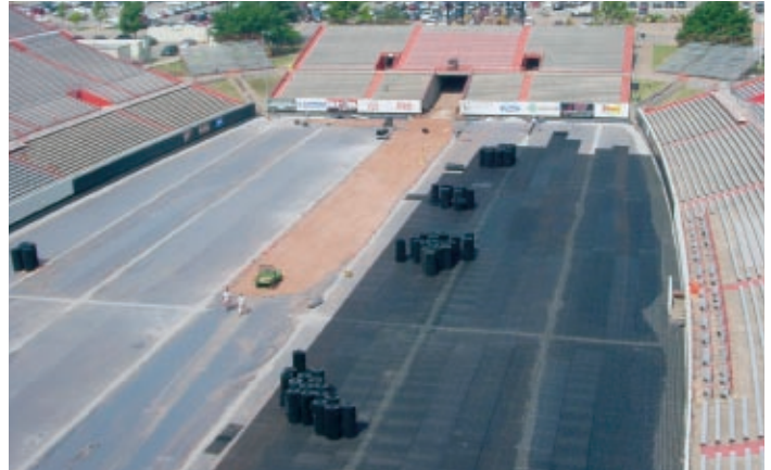
Large-scale drainage (pictured: OSU Boone Pickens Stadium), medium-size green roofs, and small planters all benefit from Draincore 2 's strength, ease, and efficiency.

“Draincore 2 is really easy to install when compared to more traditional engineering products, which translates to a lower per-square-foot cost without sacrificing the aesthetics of a project.” —Duane Dietz, AHBL, Inc.